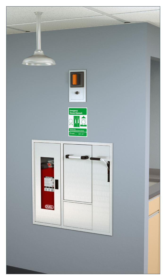
Note: Shown with optional AP280-237 electric light and alarm horn unit with silencing switch. Accommodates Oval fire extinguisher model 10JABC. (Fire extinguisher sold separately)

AP280-235 Electric strobe light and alarm horn unit for recess mounting in finished wall. Light illuminates and horn sounds when eye/face wash or shower is activated. Includes additional leads for remote monitoring.